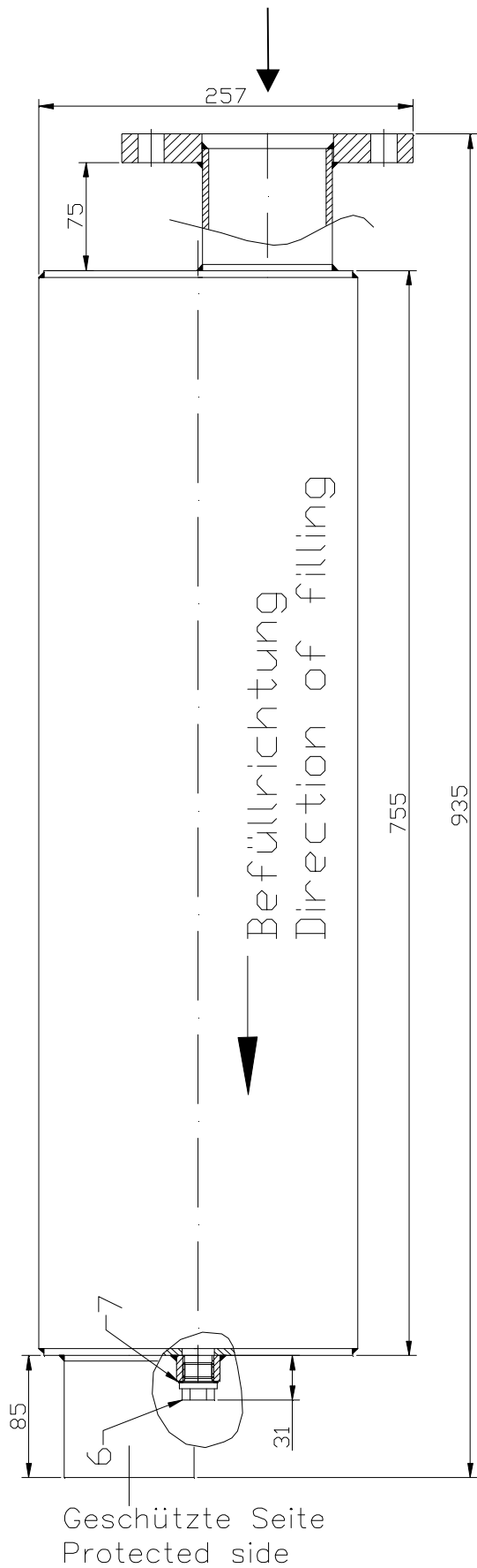
Fig. 1 Construction